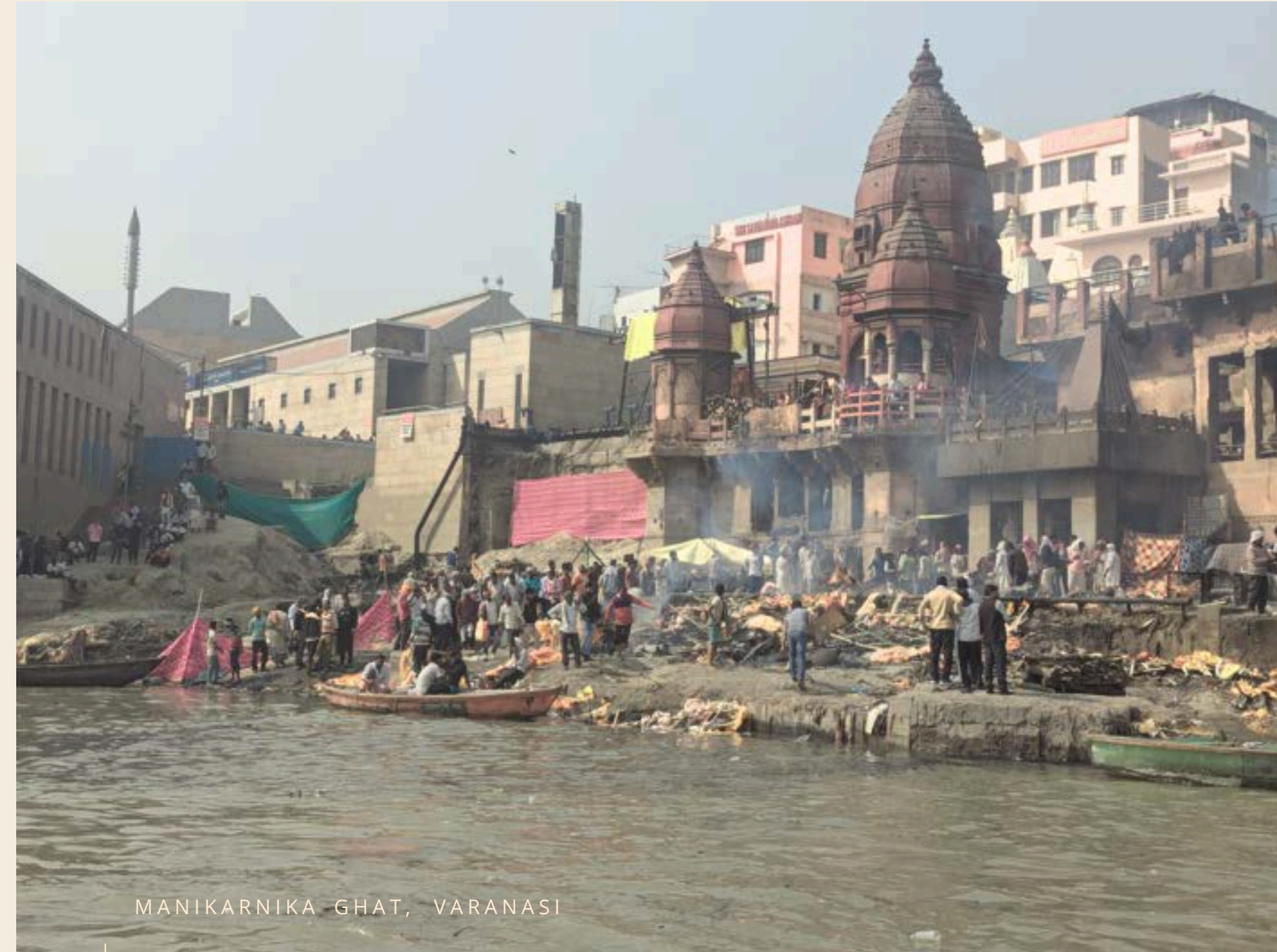
MANIKARNIKA GHAT, VARANASI

CREATING A TEMPORARY COMMUNITY OF LISTENING, SENSING, AND WITNESSING