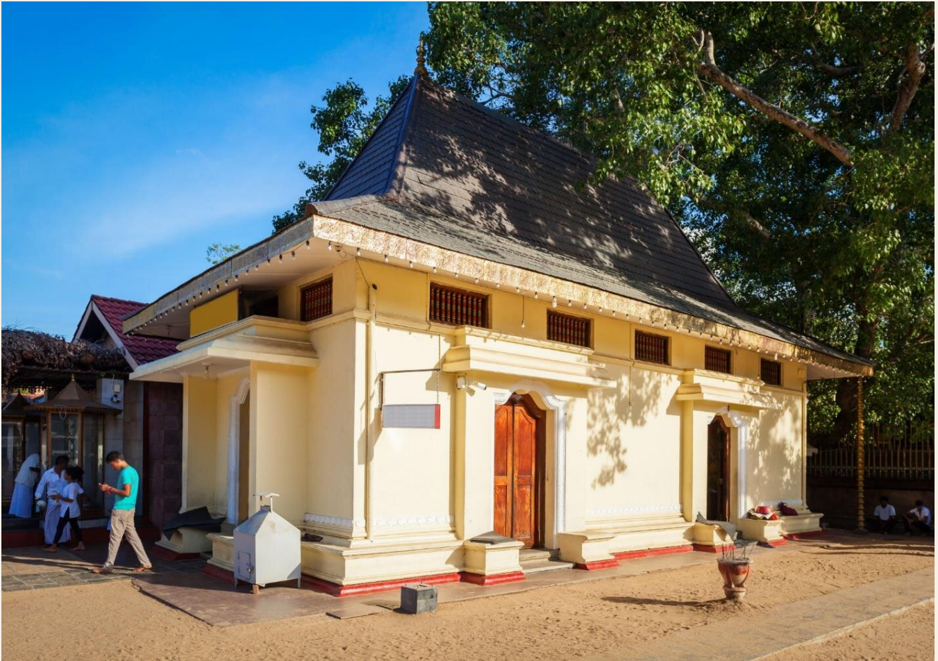
Kataragama Sacred Pilgrimage Complex

Overnight: Southern Coast (boutique hotel)