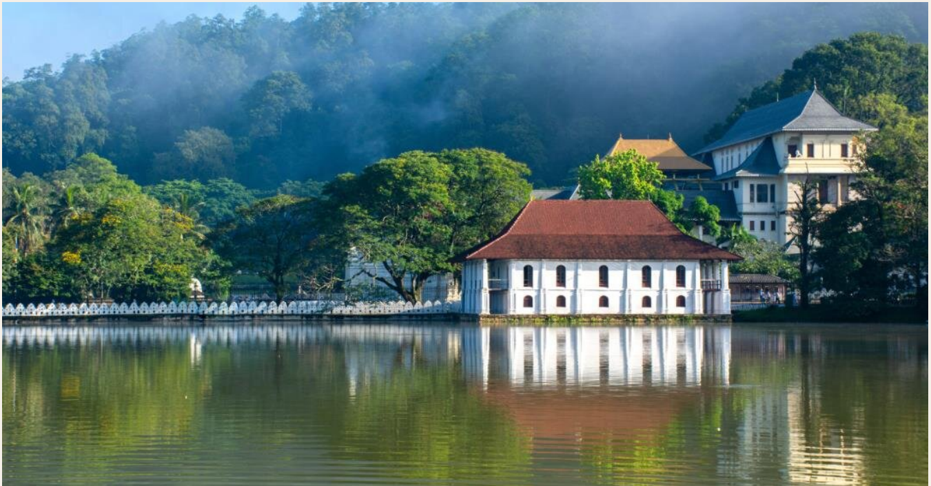
Temple of the Sacred Tooth Relic (Sri Dalada Maligawa), Kandy

In the late afternoon, we depart Kandy and continue our ascent through spectacular tea plantations and misty mountain passes to Nuwara Eliya (approximately 3 hours), where we settle into our hill country hotel for a four-night stay.