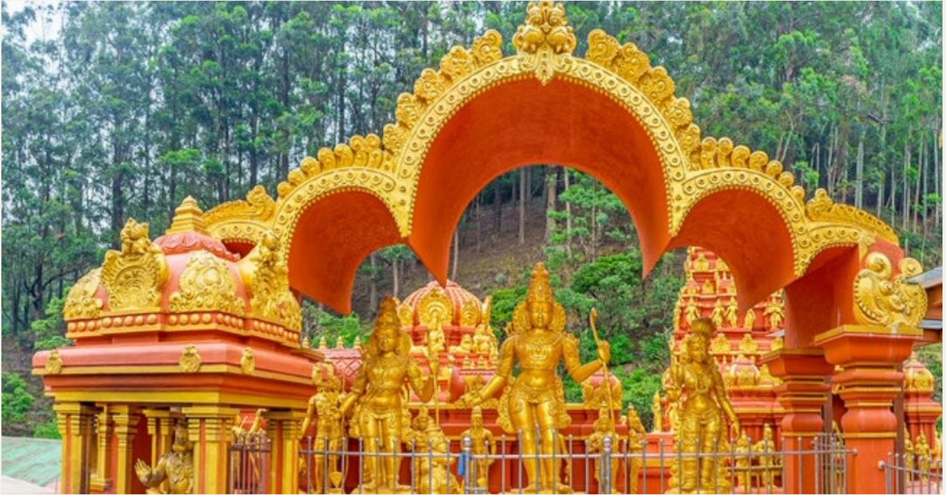
Seetha Amman Temple, Nuwara Eliya

Overnight: Nuwara Eliya (hill country hotel)