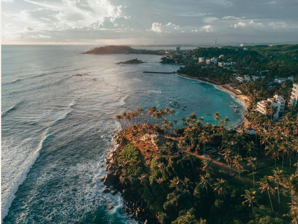
Sri Lanka's Southern Coast

Overnight: Southern Coast (boutique hotel)