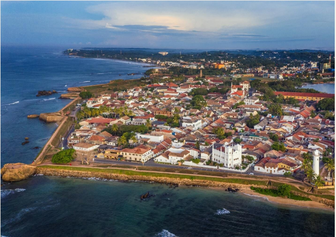
Galle Fort, UNESCO World Heritage Site

through the yātrā. We celebrate our collective journey with a special farewell dinner .