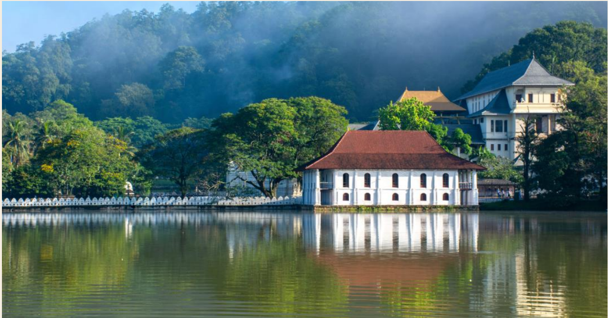
Temple of the Sacred Tooth Relic (Sri Dalada Maligawa), Kandy