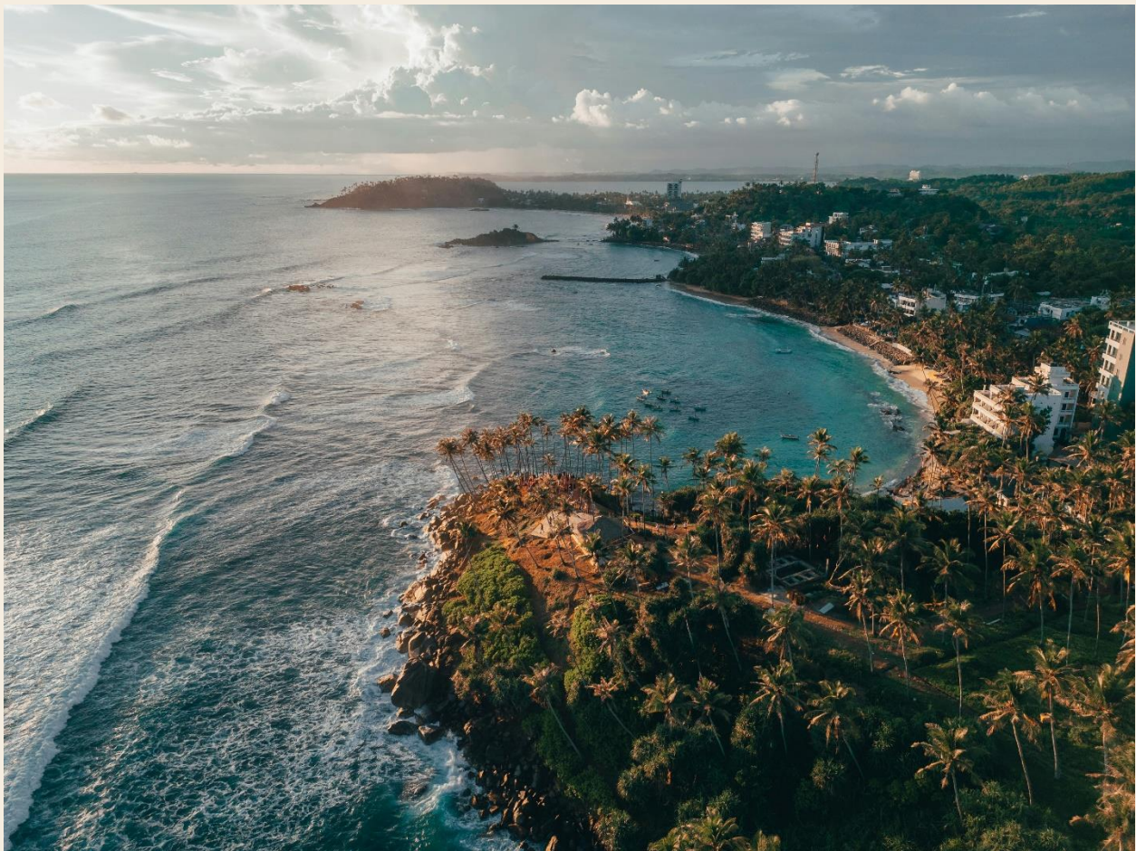
Sri Lanka's Southern Coast