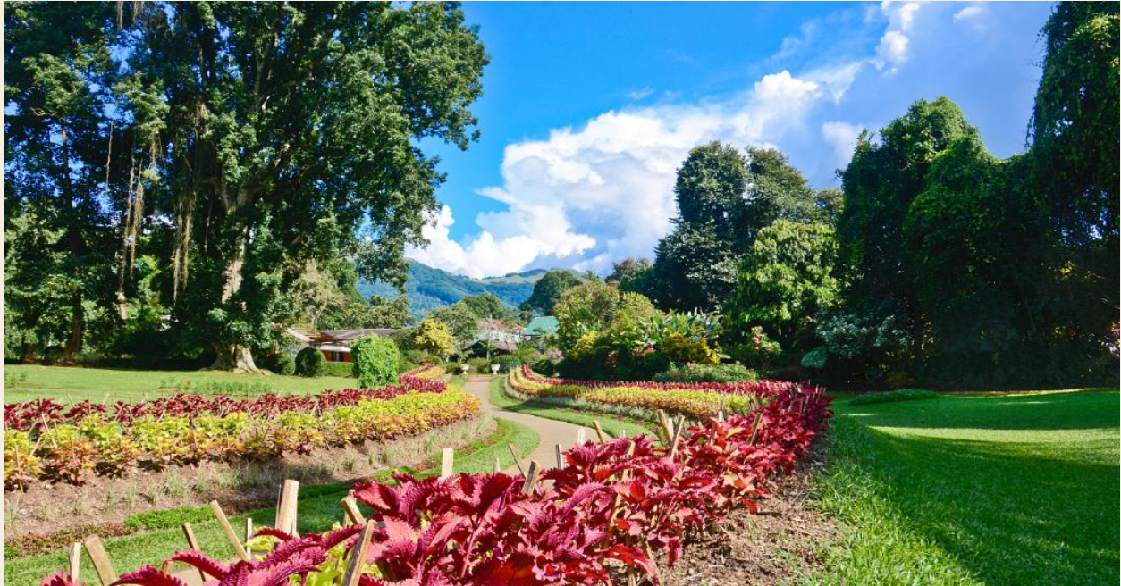
Royal Botanical Gardens at Peradeniya