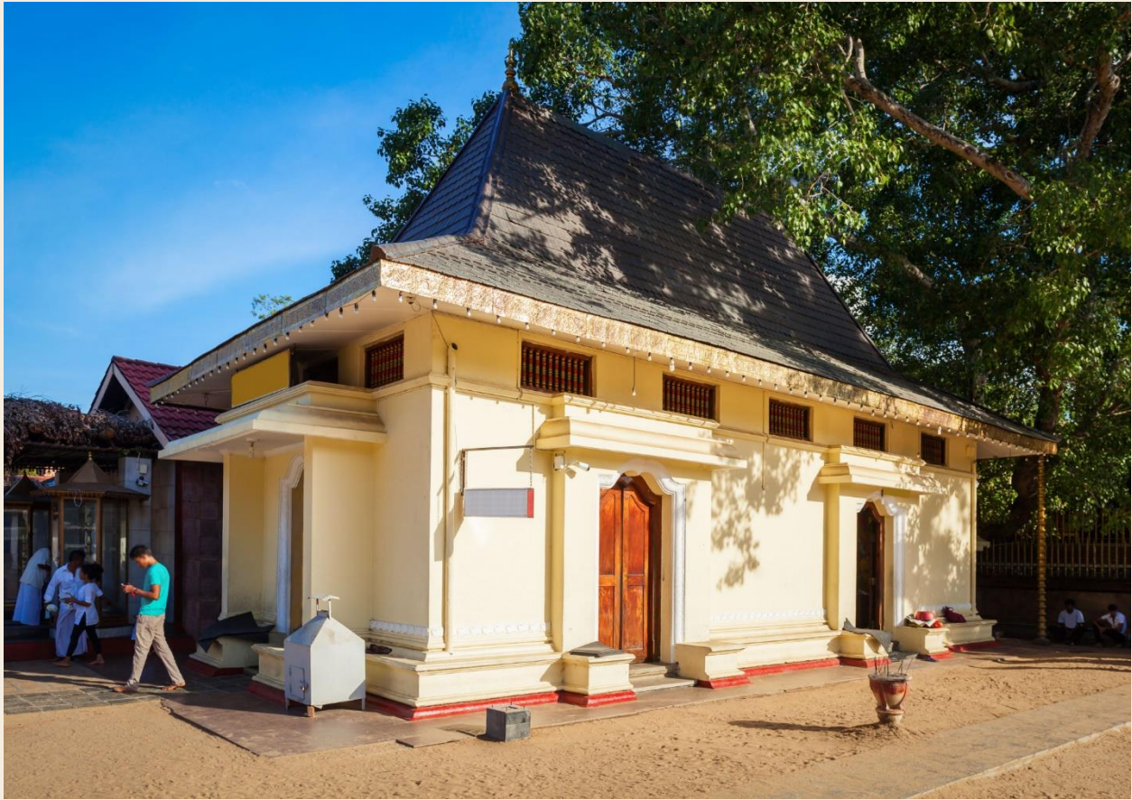
Kataragama Sacred Pilgrimage Complex