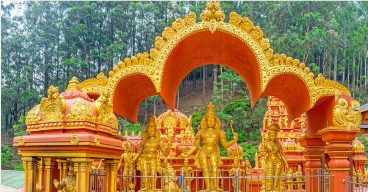
Seetha Amman Temple, Nuwara Eliya